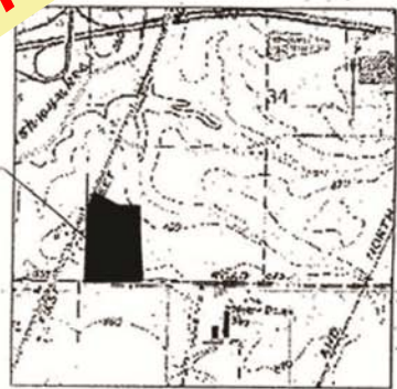
Location Map Not to Scale

Document # 425112 creating the existing 20 foot sanitary sewer easement also vacates previously granted easement per Document # 411979.